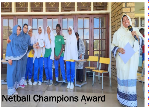
Netball Champions Award