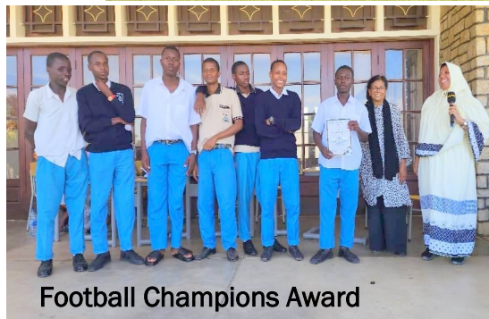
Football Champions Award